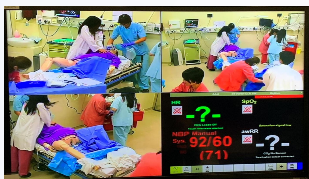
Knowledge and Skill Exchange

Cooperate and Collaborate between A&E and Pedi in organizing Conjoint Simulation Training